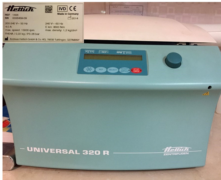
Fig. 1 Refrigerated centrifuge“ Universal 320R Hettich Zentrifugen“

intervention, while we did not record any adverse effects during this trial.