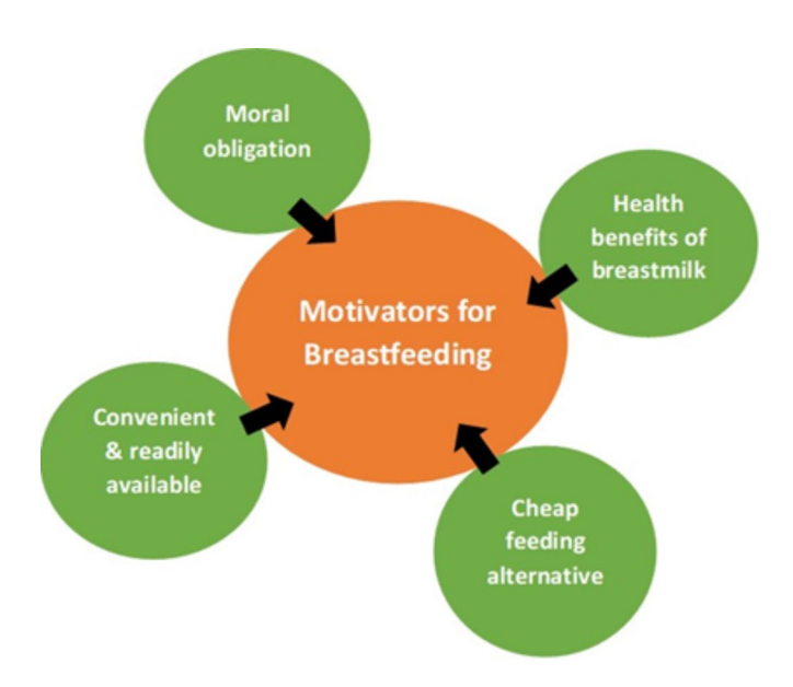
Fig. 3 Motivators for breastfeeding among women in institutions without complete breastfeeding support environment

expressions of their motivations on health benefits of breastmilk: