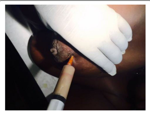
Fig. 1 Lactational breast abscess. Aspiration of pus with a 14-gauge needle mounted on a 20 mL syringe

We performed the procedure on an outpatient basis. A 14-gauge needle mounted on a 20 mL syringe was used for aspiration without ultrasonographic guidance. Local anesthesia (lidocaine 2%) was infiltrated at the puncture site using a 29-gauge needle, then a 21 G and finally the 14 G needle. We selected the entry site after cleansing with chlorhexidine to avoid the area of skin thinning if present, where an abscess may drain spontaneously. We aspirated the abscess thoroughly and irrigated the cavity with saline until the aspirate became clear (Fig. 1). This method enabled loculations to be disrupted. We did not send the aspirate to the laboratory for culture because of elevated cost. In some cases, we injected 1 g of ceftriaxone directly into the abscess cavity. Oral flucloxacillin, 500 mg four times a day or erythromycin propionate in case of hypersensitivity of penicillin, was also administered for 10-14 days to these patients. Follow-up of patients was by clinical examination and dressing every 2 days for 1 week and every week for two consecutive weeks,